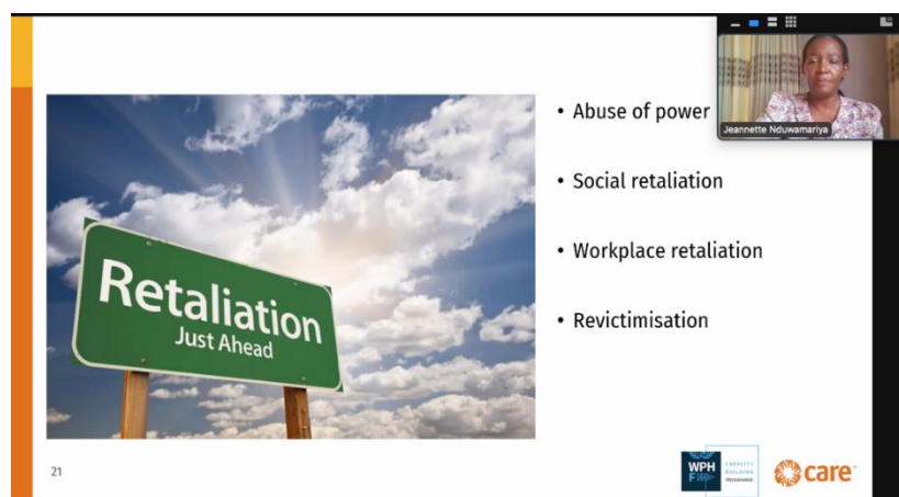
Photo 3 : WPHF PSEAH Capacity Building Webinar in pro-bono partnership with CARE

trainings. It should also be noted that sometimes several CSO members attend the session from the same computer but are not registered or counted as participants.