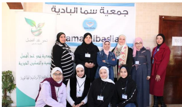
Photo 2 : NAGAT and Samia Al Badia CSO teams in Jordan (2021 CSO Peer Learning Awards)

In 2022, 10 women CSO leaders were supported to engage in peace and crisis response with a focus on youth and facilitated mutual capacity strengthening among them and their CSOs, in collaboration with Women Have Wings (WHW) 9 . The ten nominated women implemented five peer learning projects in tandem. All the projects, focused on youth, in DRC, Jordan, Nigeria, Palestine, and Uganda increased the capacities of 106 CSOs members (66.0% women, including staff, board members and volunteers) in management, M&E, strategic planning, gender and feminism concepts, community mobilization, resource