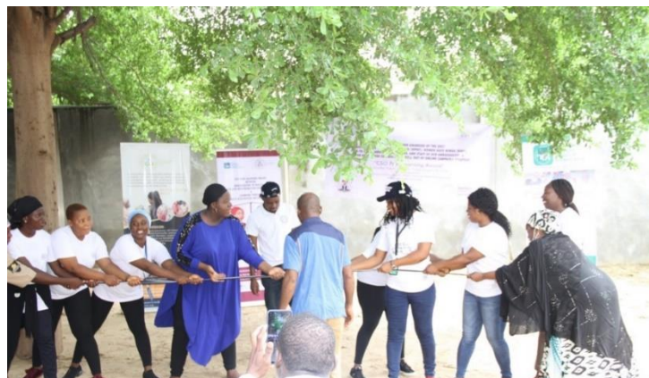
Photo 1 : DRC Ambassadors & LETSAI teams during their peer learning project in Nigeria (2021 CSO Awards)

During the reporting period, the L-HUB mobilized both external and internal expertise to provide 33 training and knowledge exchange activities to at least 918 civil society participants in 31 countries, an increase of 307 participants from 2021. These sessions were designed based on CSOs’ priorities expressed